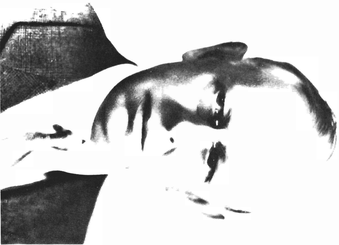
JESSE LIVERMORE: Millionaire

Pictured just after he had made his third multi-million market comeback, Jesse Livermore had become a legend on the Street. He was a member of the New York Curb and The Chicago Board of Trade. But he could never realize a life-long ambition to become a member of the New York Stock Exchange.