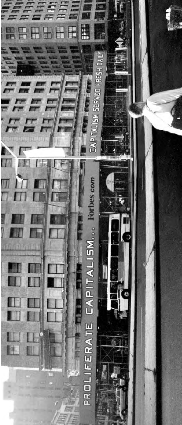
An advertisement on a Manhattan building opposite the famous Flatiron Building, on the corner of Fifth Avenue where Broadway crosses at West 23rd Street. Photograph taken by the author during her investigations, when the dot.com boom was actually subsiding: 14 September 2000.